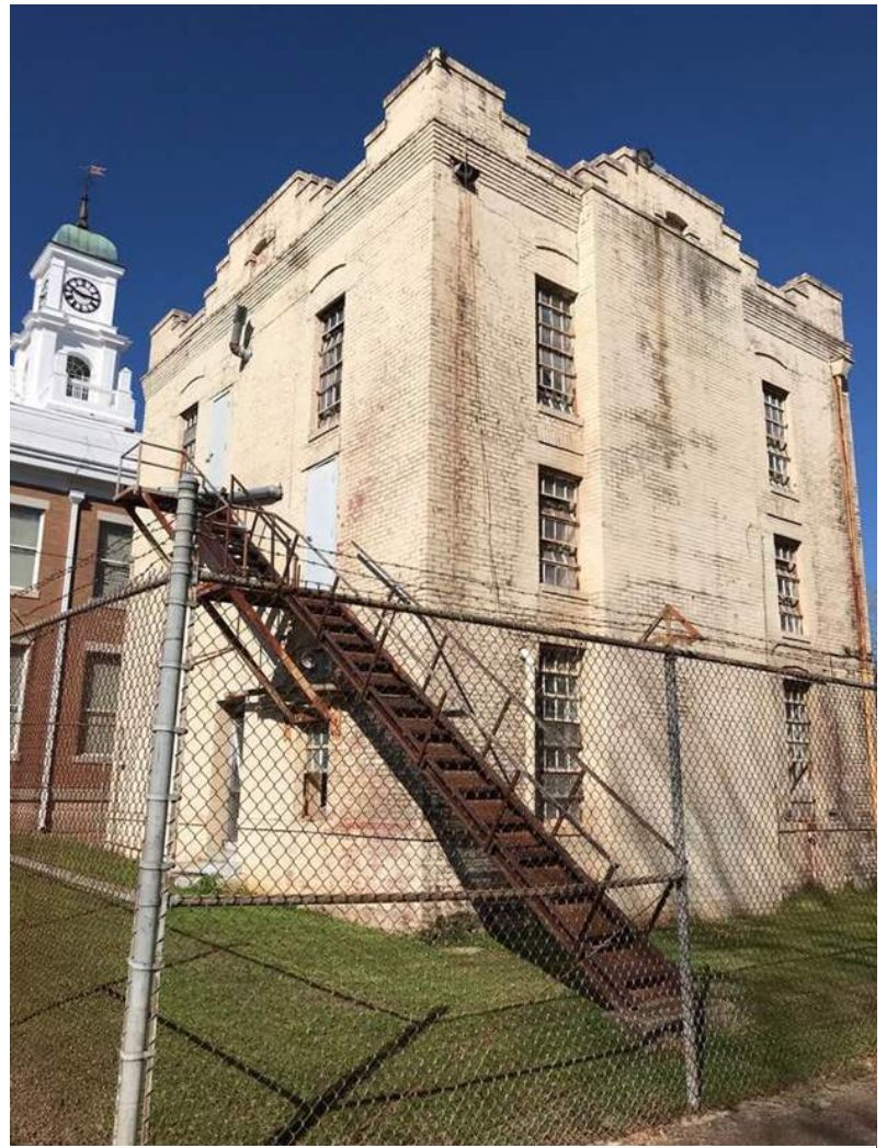
The Old Hale County Jail

Ashley Dumas: 205.652.3830, adumas@uwa.edu