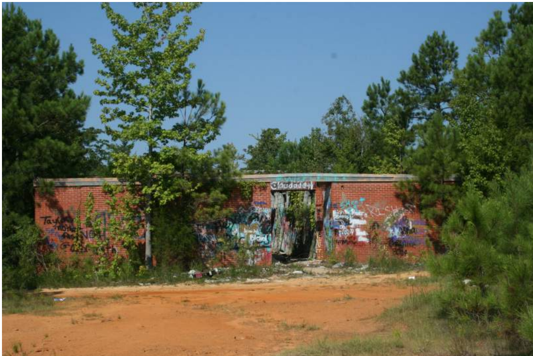
Ada Hanna School