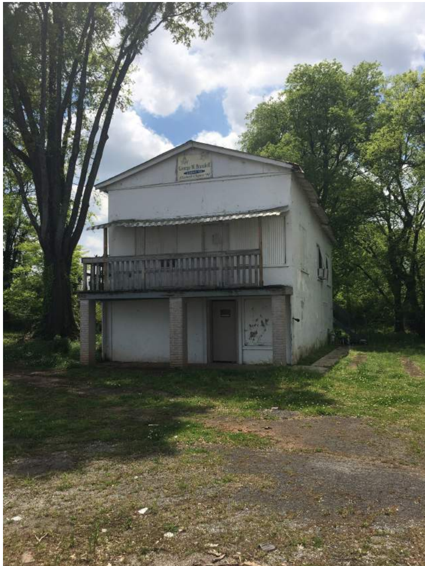
George W. Braxdall Lodge #28