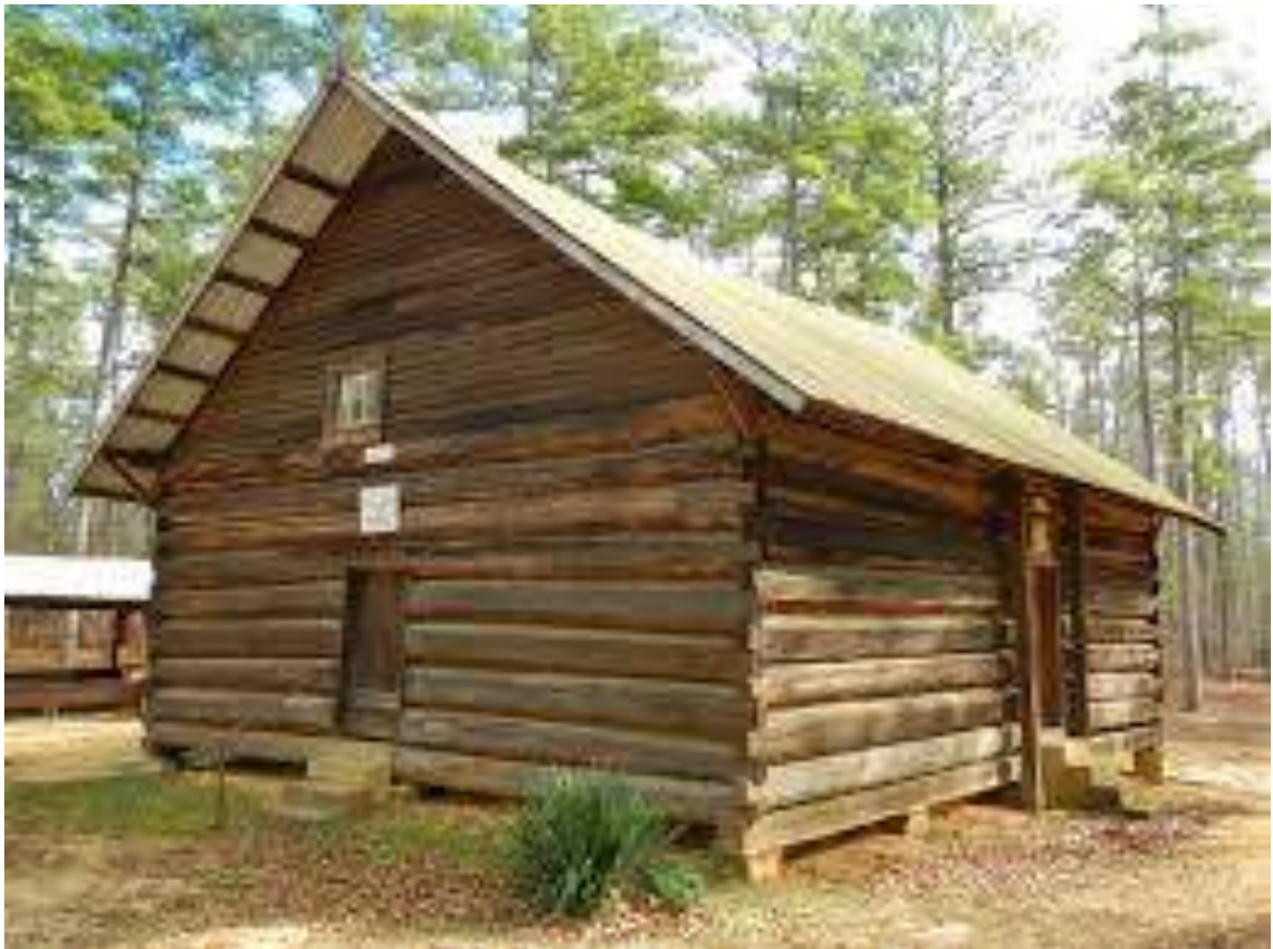
Shoal Creek Baptist Church