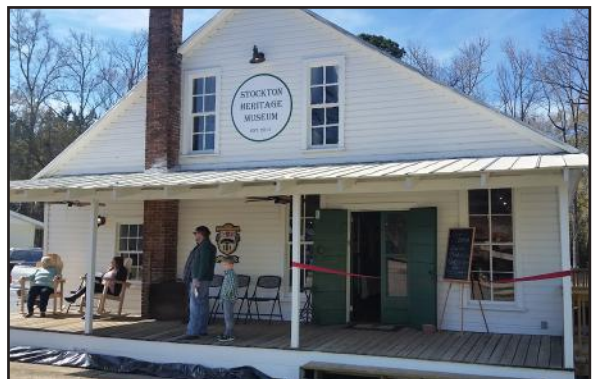
Stockton Heritage Museum

When making reservations at The Muskogee Inn, ask for the group rate for the Alabama Trust for Historic Preservation.