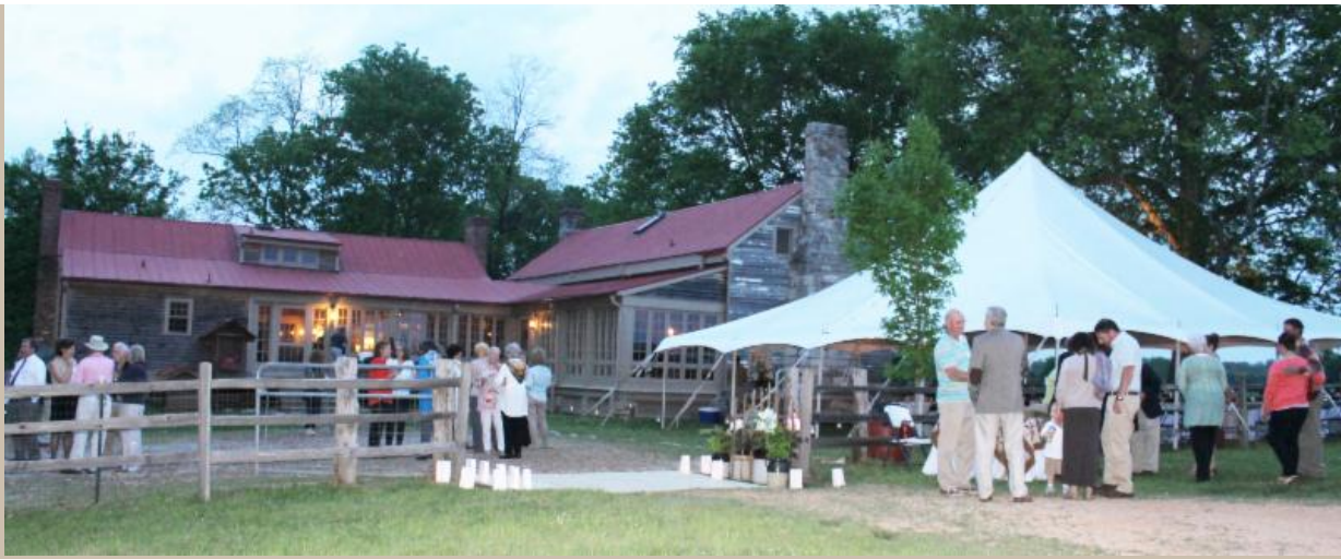
Experiencing Heritage Farming with the O'Neals, a night to remember.