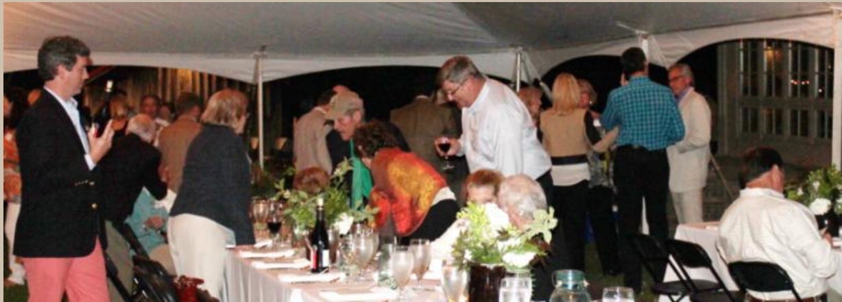
Partaking in the Farm to Table Culinary Movement, preservation of heritage farms and historic venues.